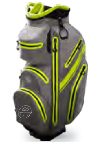
CHARCOAL || CITRON