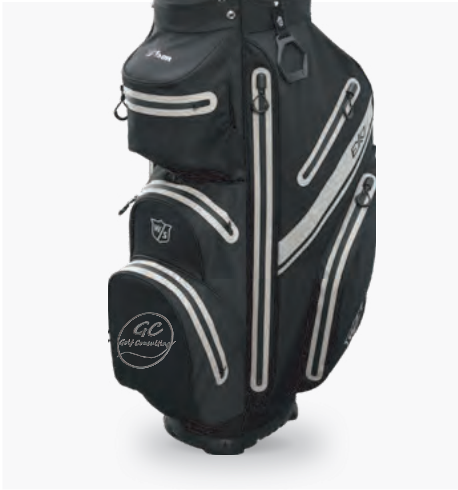
BLACK || SILVER