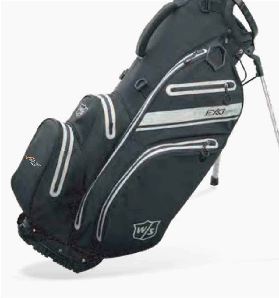
BLACK || CHARCOAL || SILVER