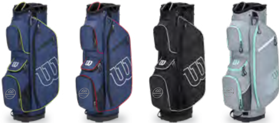
BLUE || GREEN BLUE || RED BLACK || WHITE JADE