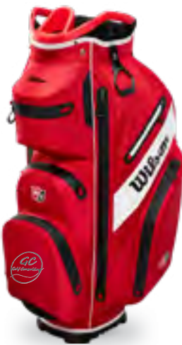
RED || WHITE || WILSON