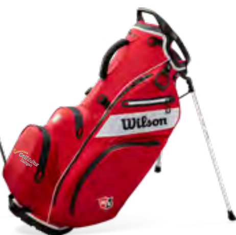
RED || WHITE || WILSON