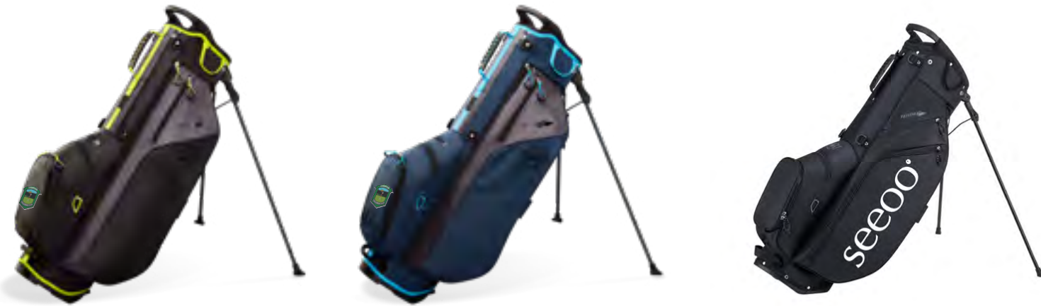
BLACK || SILVER || CITRON