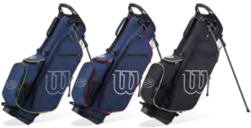
BLUE || GREEN BLUE || RED BLACK || WHITE