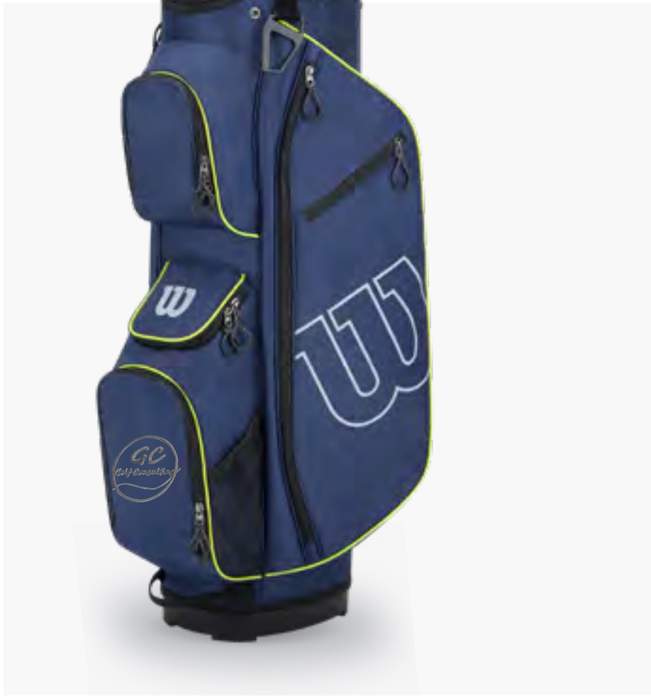
WEIGHT 3.5 lbs - 1.6 kgs