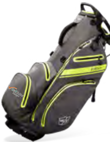
CHARCOAL || CITRON || SILVER