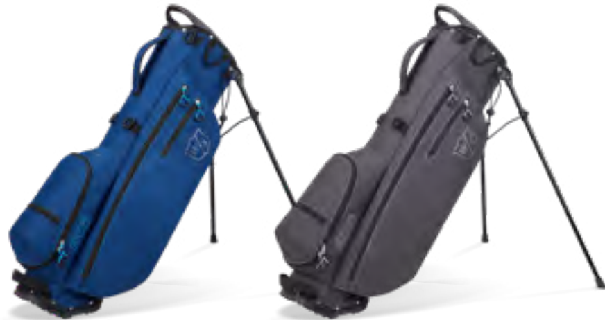
DEEP OCEAN BLUE