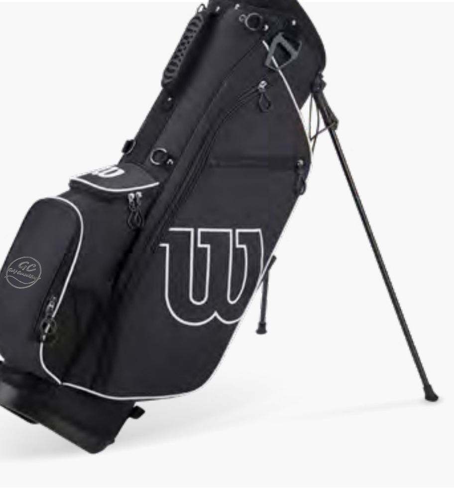
WEIGHT 3.9 lbs - 1.8 kgs