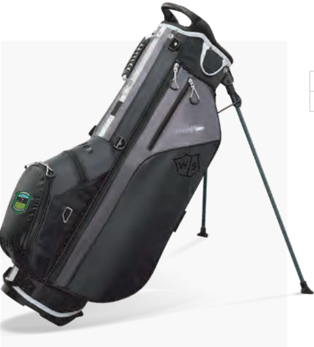
BLACK || CHARCOAL || SILVER