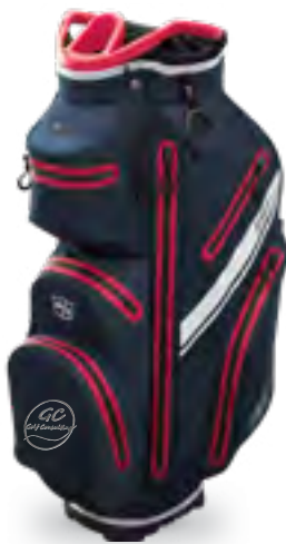
NAVY || RED || WHITE