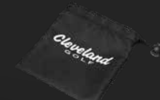
Included with any sole weight purchase.