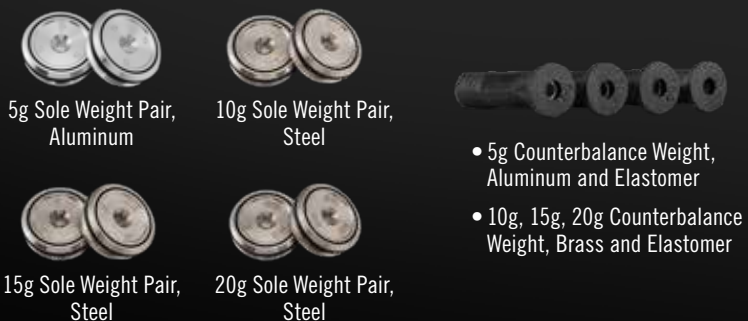
5g Sole Weight Pair, Aluminum