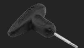
Not included with sole weight purchase.