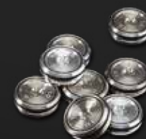
Includes 5g, 10g, 15g, 20g Sole Weight Pairs.