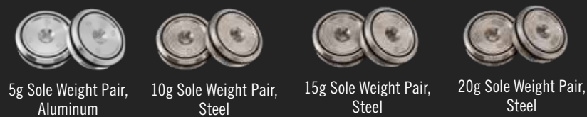
5g Sole Weight Pair, Aluminum